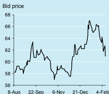
Chart 2 Boden 12 price